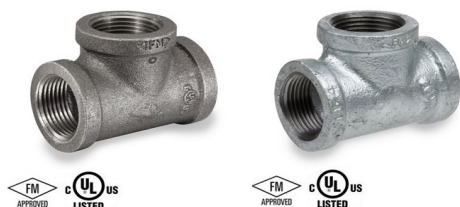
Class 150 Malleable Iron - Female NPT x Female NPT x Female NPT Black and Galvanized